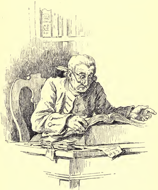
'A clerk put out his head.'

'Oh, sir, no doubt, compare as much as you please—no